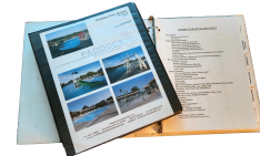
Paddock Pool School Reference Guide included

CANCELLATION: 50% refundable until 5 days prior to the course.