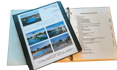
Paddock Pool School Reference Guide included

CANCELLATION: 50% refundable until 5 days prior to the course.